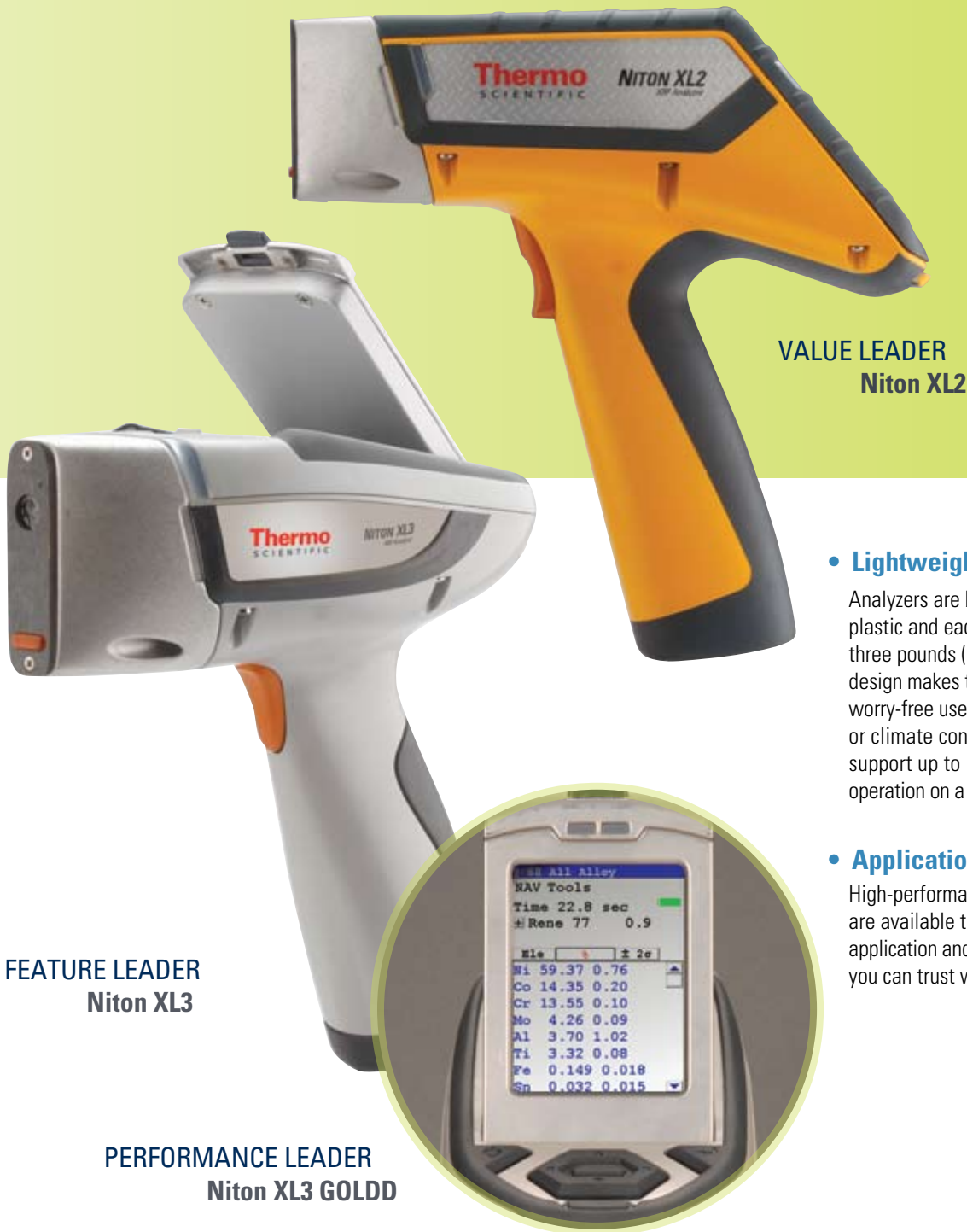
VALUE LEADER Niton XL2