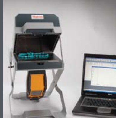
Portable Test Stand