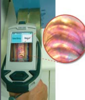
Thermo Scientific WeldSpot™